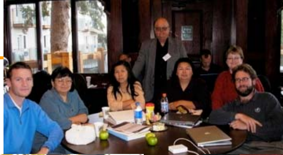
Huslia, Kaltag & Koyukuk Staff