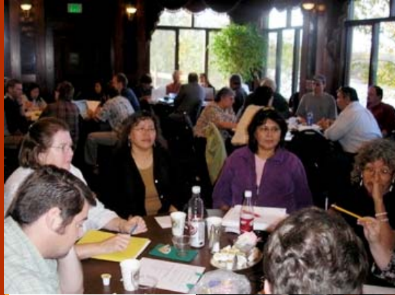
Allakaket & Hughes Staff