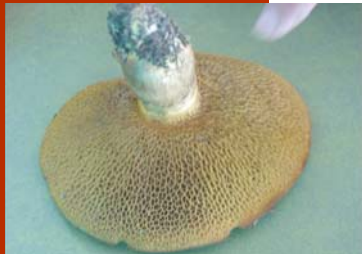
Examining Mushrooms in Manley