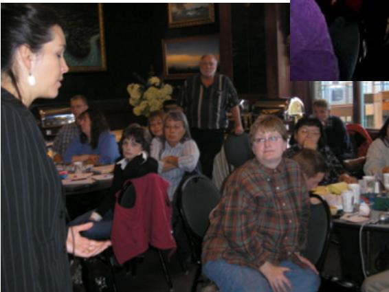
Thank you to our World Wide IDEA presenters!