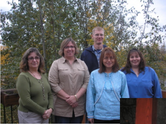
Minto, Nulato & Ruby Staff