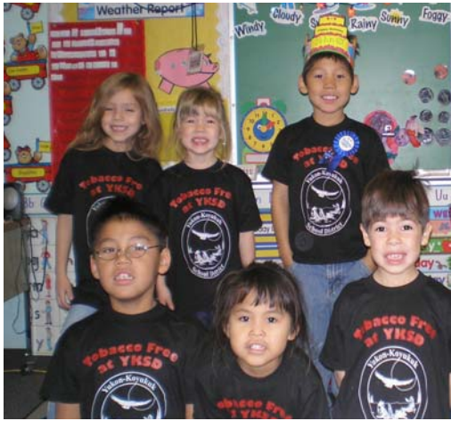
Happy to be tobacco free in Huslia!