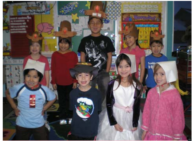
Huslia K-1 students enthusiastically perform a Thanksgiving play for the school and community!