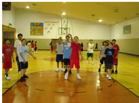
Boys Shooting Contest