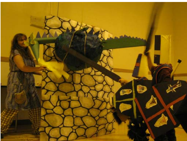
Chase and Tao fight the might dragon and win