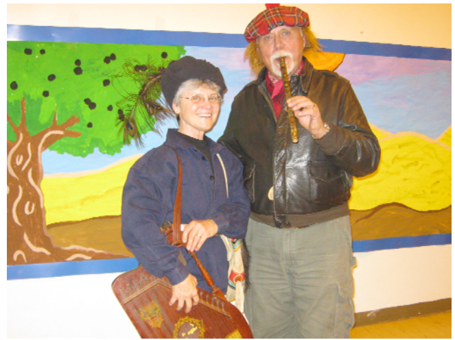
Community members came dressed for the time period.