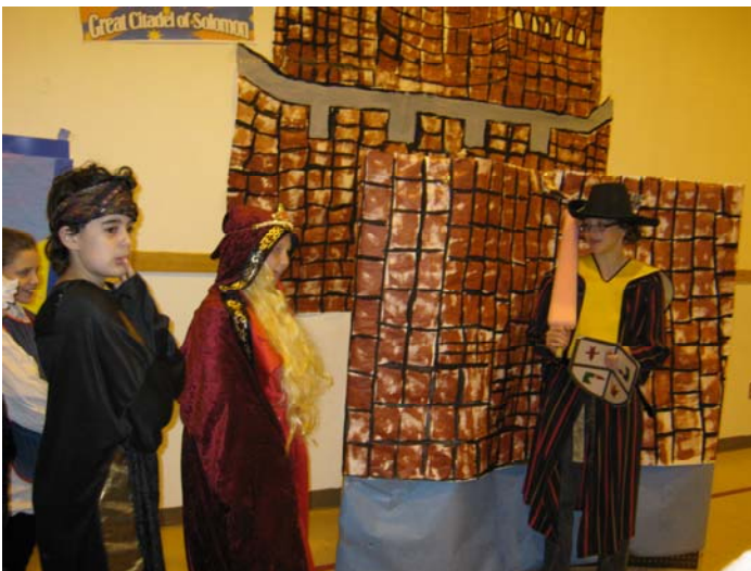
Queen of Sheba advances on the castle- stopped by the guard.