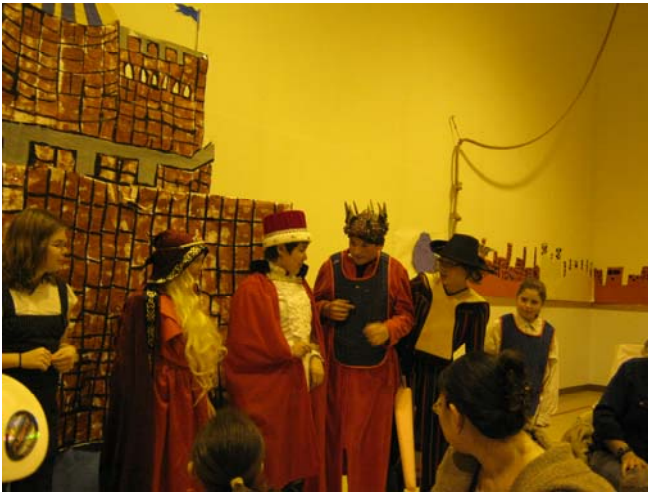
King Solomon and Queen of Sheba