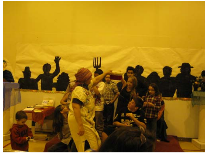
Students help pull names for raffle.