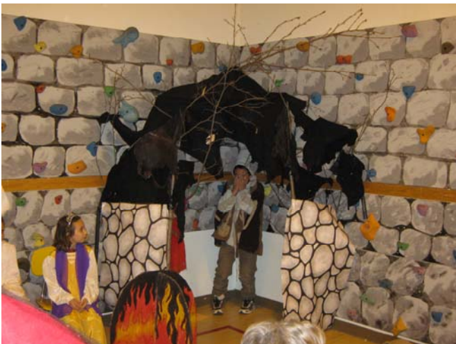
Mohammad's cave where he gets a vision from god.