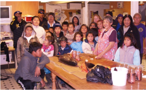
Kaltag students and teachers went to the Kaltag Tribal office to watch and learn how to cut fish and later on they jarred it for the Kaltag Elders lunch