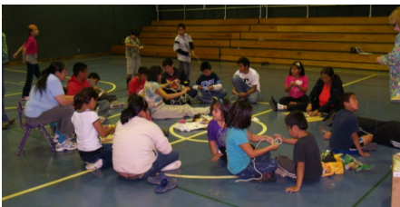
Kaltag staff & students were learning how to tan fish skin for boots and how to make knots.