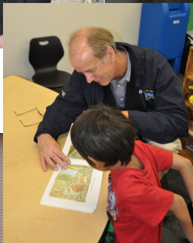
Senator French reading to a pre-k student in Allakaket.