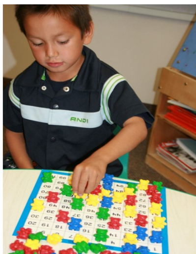
Seneca playing with counting bears