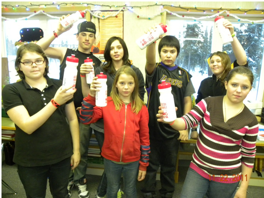
Manley MS/HS students giving cheers to Red Ribbon Week!