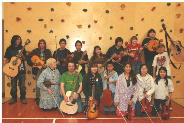
Dancing with the Spirit