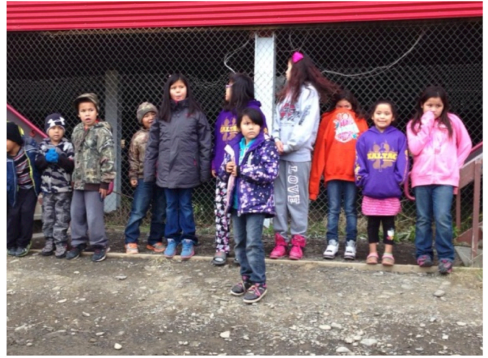
Kaltag students getting ready for the Fun Run