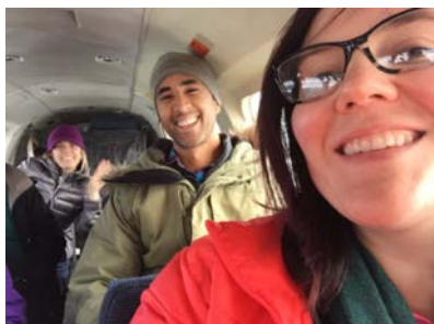
Already looking forward to the next trip!