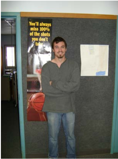
HUSLIA'S NEW MATH & SCIENCE TEACHER