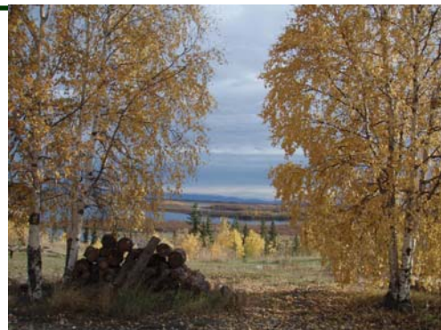
Fall scenery in Minto